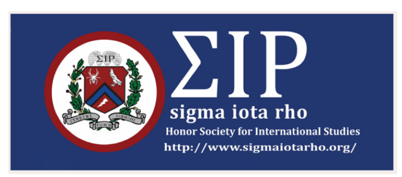
Wall Banner $75