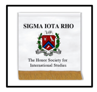
Podium Banner $75

Distinguish Yourself with SIR Induction Package Chapter Enhancements!