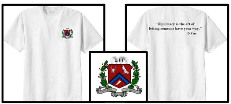
Crest Global T-Shirt $18