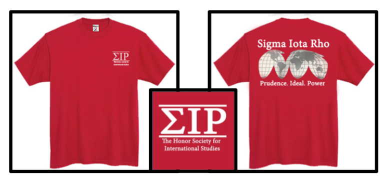
SIR Global T-Shirt $18